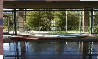
Typical Floor Plate